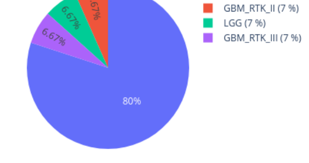
Copy number plot

Neighbors in UMAP for 207130360045_R06C01