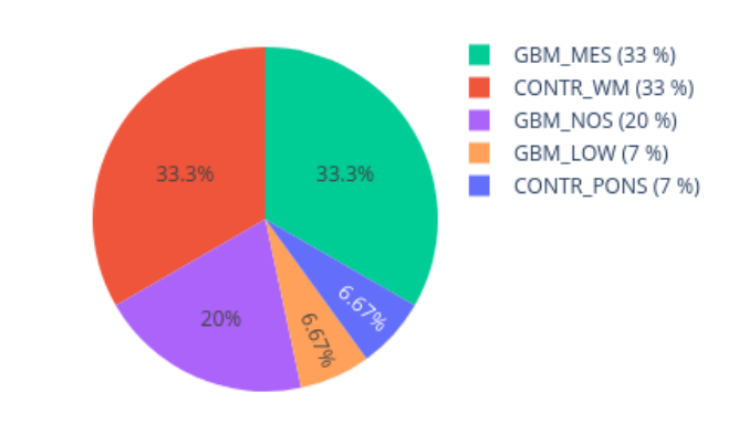
Copy number plot

Neighbors in UMAP for 207130360052_R04C01 reference: AllIDATv2_20210804_HPAP_Sarc.xlsx (19967 cases), 0 CpGs