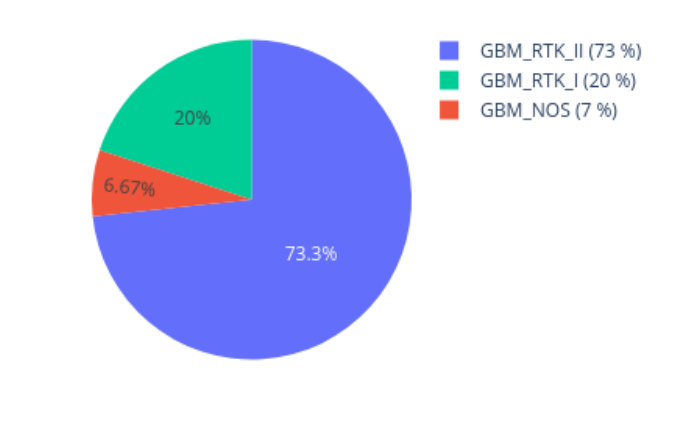
Copy number plot

Neighbors in UMAP for 207130360089_R06C01 reference: AllIDATv2_20210804_HPAP_Sarc.xlsx (19967 cases), 0 CpGs