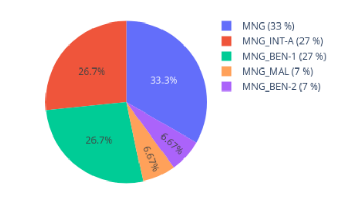
Copy number plot

Neighbors in UMAP for 207130380030_R07C01 reference: AllIDATv2_20210804_HPAP_Sarc.xlsx (19967 cases), 0 CpGs