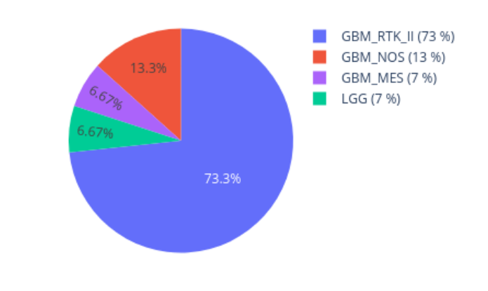
Copy number plot

Neighbors in UMAP for 208128750020_R01C01 reference: AllIDATv2_20210804_HPAP_Sarc.xlsx (19967 cases), 0 CpGs