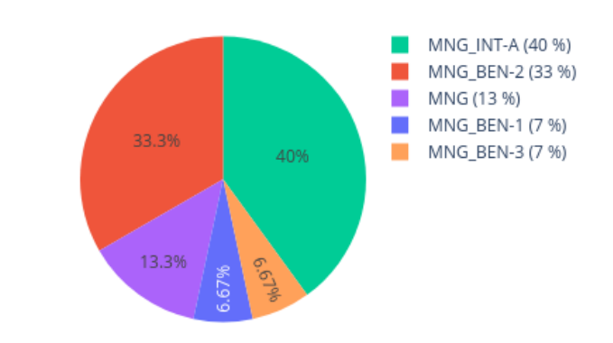
Copy number plot

Neighbors in UMAP for 208369610067_R04C01 reference: AllIDATv2_20210804_HPAP_Sarc.xlsx (19967 cases), 0 CpGs